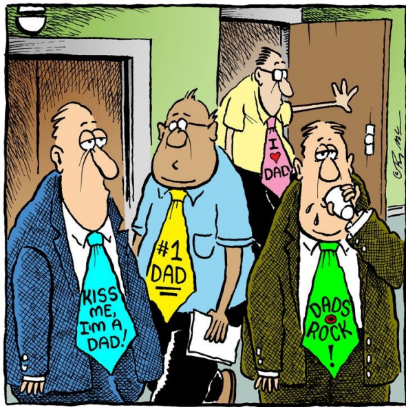
The day after Father's Day.

LAT UW VCLJ MXNO NA KCTWC MXLM JKZ SLJ FNBW L FNPW UKCMXJ KP MXW FKCT LAT SLJ VFWLOW XNS NA WBWCJ ULJ.